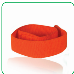
Velcro cord for taking off