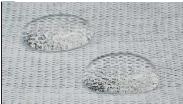
Redigauz is water repellent.