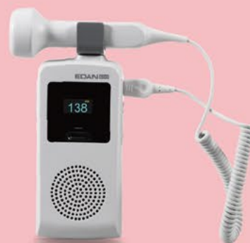
SD3 Ultrasonic Pocket Doppler