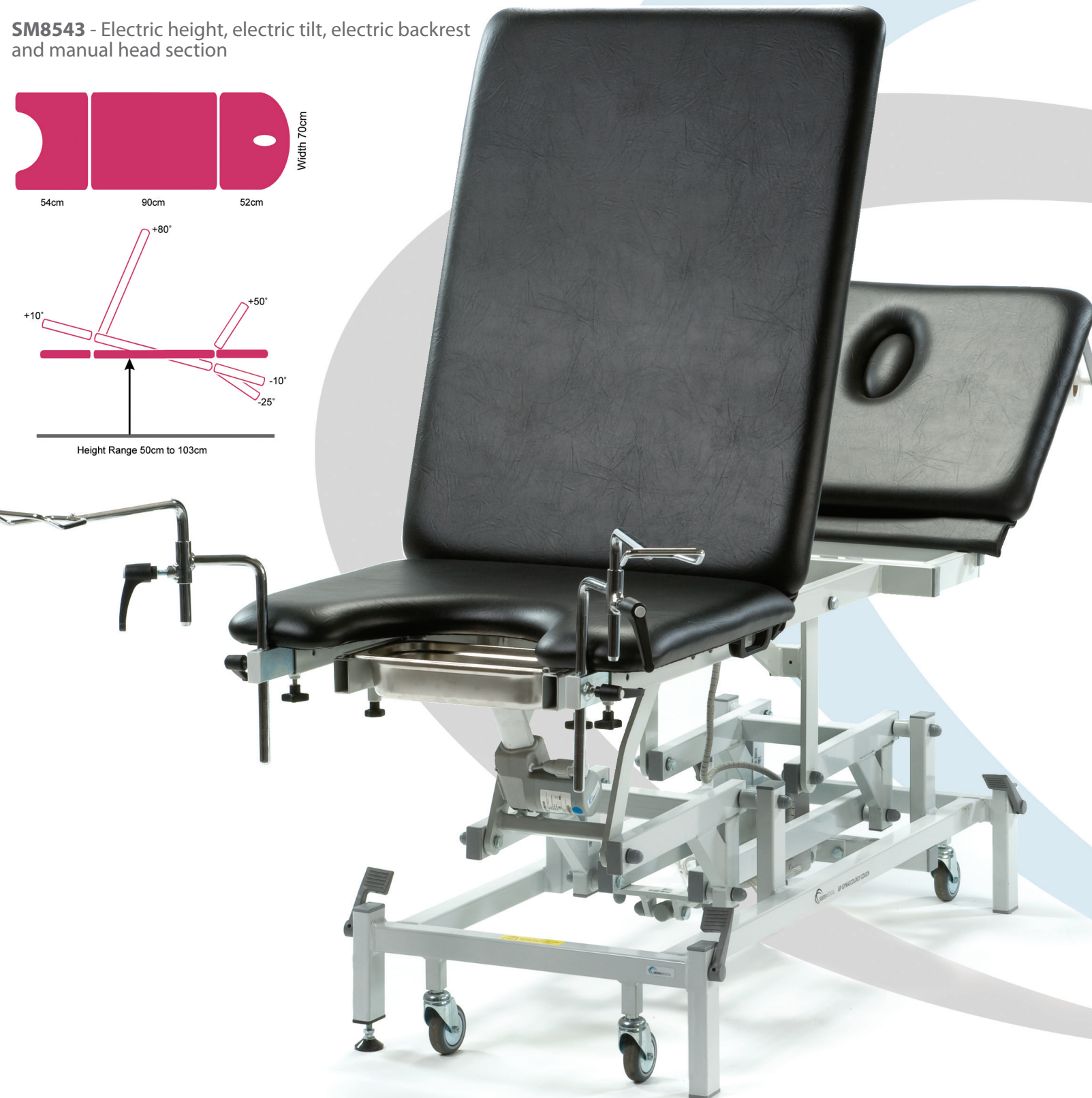
Model SM8543 with Lithotomy Stirrups. Colour Black