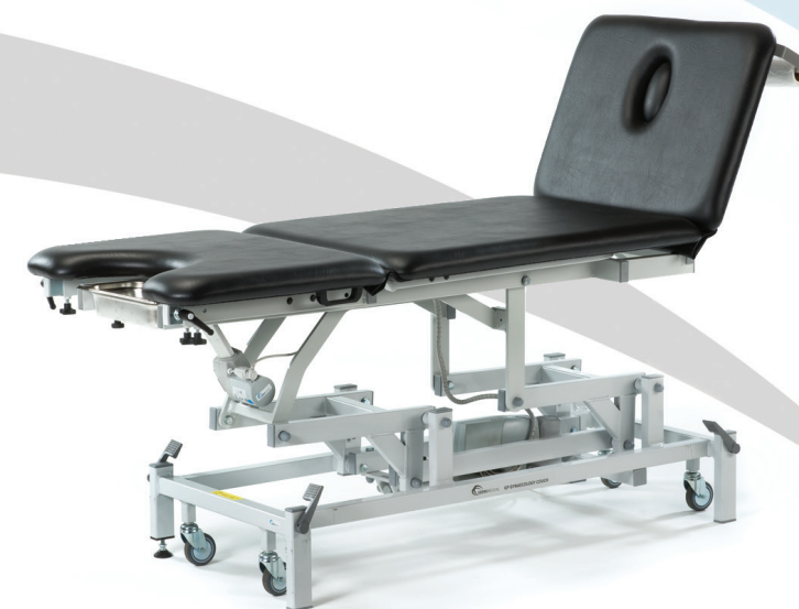
Model SM8543 with raised head section