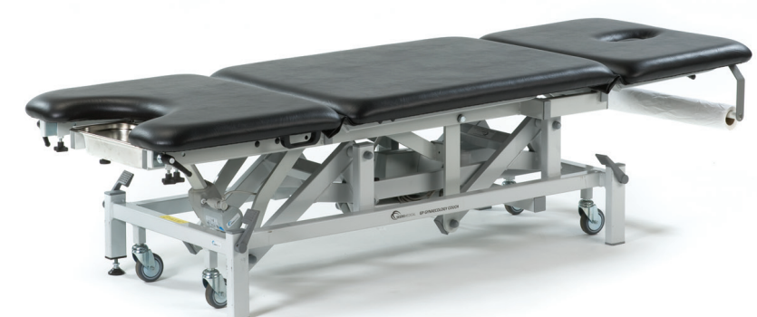
Model SM8543 at Low transfer height