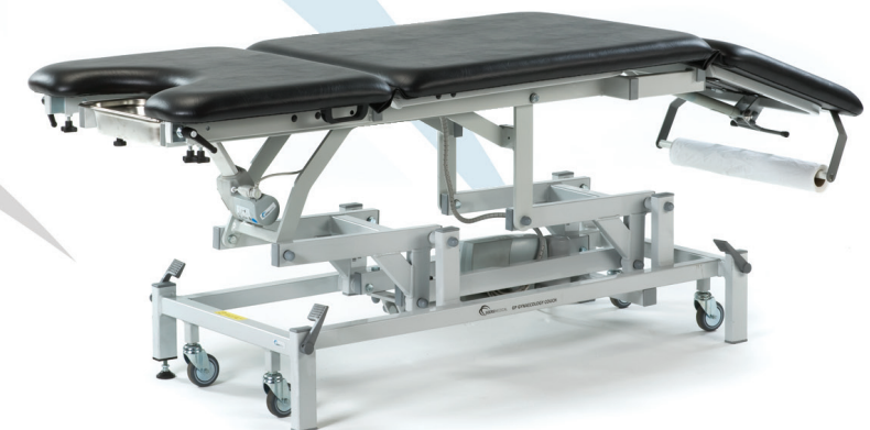
Model SM8543 with head section negative