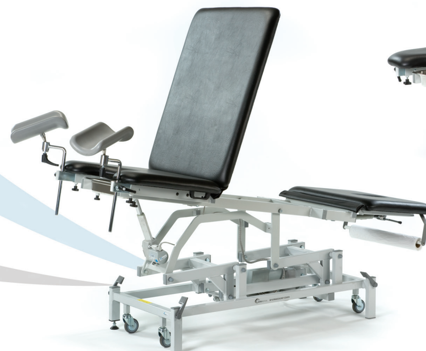
Model SM8543 with electric tilted seat angle