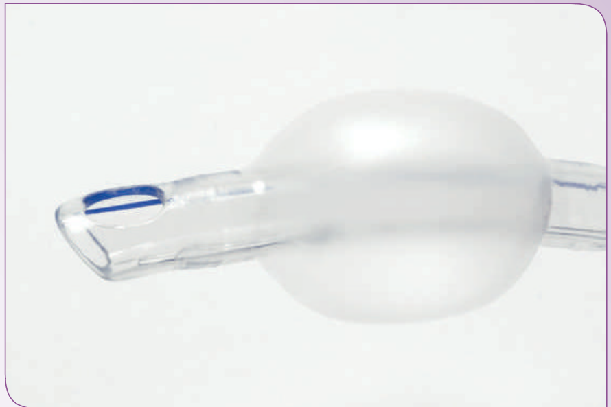
Low pressure high volume cuff