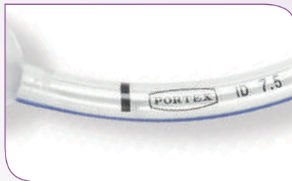
Intubation depth marker