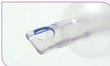
Smooth Murphy eye