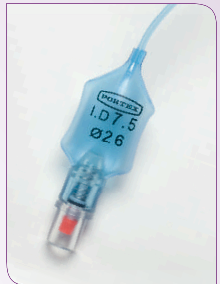
Printed pilot balloon