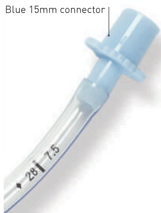
Blue 15mm connector