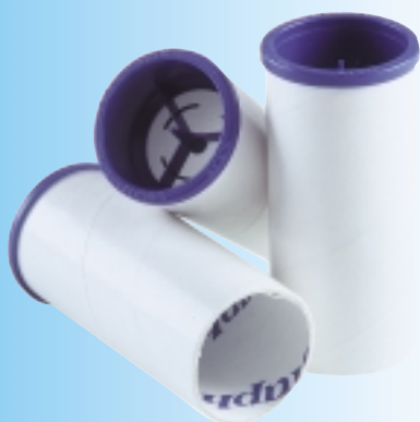
SafeTway ® mouthpiece

Where biting a mouthpiece of 30mm diameter is difficult, use the 22mm Mini SafeTway ® .