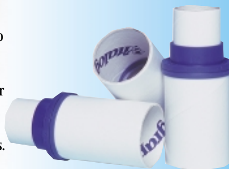
Mini SafeTway ® mouthpiece