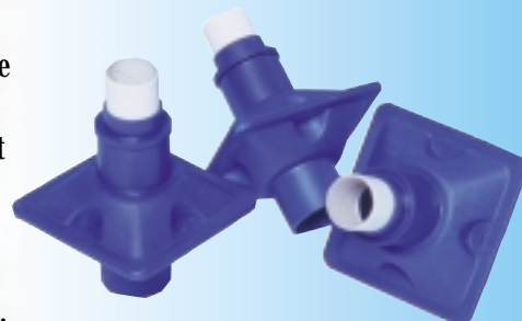
Mini Bacterial/Viral Filter

Adaptors available to fit most respiratory test equipment