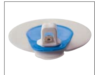
F = 3 mm fitting