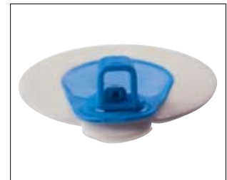
A = 4 mm fitting